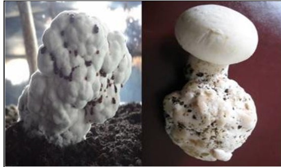
Fig.1. Characteristic symptoms of wet bubble disease