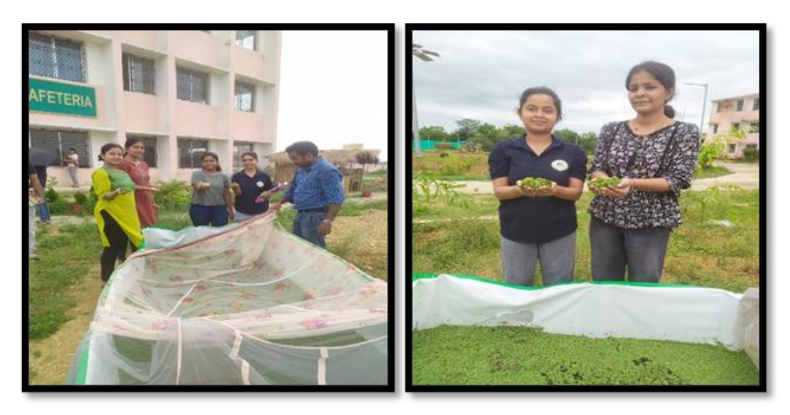
Fig. 2: Azolla production unit

The demand of organic agriculture is at its peak due to rising health and fitness awareness. The fact that Azolla is a Biofertilizer that possesses a rapid rate of multiplication and can be directly applied to soil in its living form is of utmost importance and usage. For small and marginal farmers, Azolla can be an economically feasible solution. The health hazards associated with chemical fertilizers can only be done away with by the use of potential biofertilizers in the fields. Rice being a major crop, Azolla can be a low input investment for farmers who are not economically strong. The positive environmental effects of the fern prove it to be a good choice.