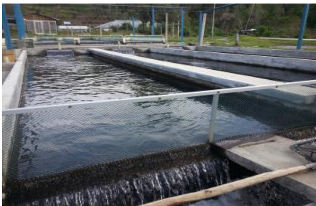
Fig. 3: Series Raceway