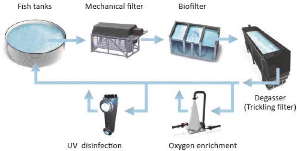
Fig. 1: Components of RAS

Up for splash out, evaporation and that used to flush out waste materials. The reconditioned Water circulates through the system and not more than 10% of the total water volume of The system is replaced daily.