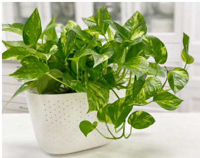
CN: Pothos SN: Epipremnum aureum F: Araceae

Rare and visually attractive plants such as Pothos ( Epipremnum aureum ), Philodendron ( Philodendron hederaceum ), Bird's nest ferns ( Asplenium nidus ), Monstera ( Monstera deliciosa ), and Watermelon peperomia ( Peperomia argyreia ) gained popularity because they were frequently displayed online, which increased demand, market value and hence social media became an important marketing tool. Attractive images, live sales and interaction through social media help boost the ornamental plant sales (Mubarok et al. , 2023).