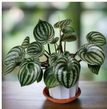
CN: Watermelon peperomia SN: Peperomia argyreia F: Piperaceae