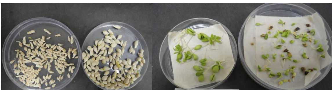
Fig. 1. Under-developed and bold seeds Fig. 2. Germination in bold & under-developed seeds