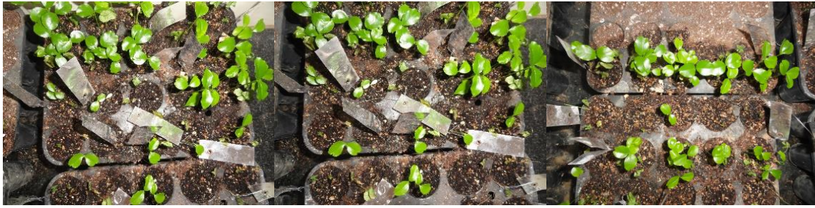
Fig. 3. Transferring germinated seeds in the plastic trays carrying commercial soil mixture