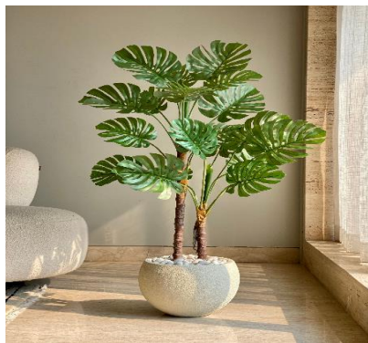
CN: Monstera SN: Monstera deliciosa F: Araceae