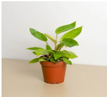
CN: Philodendron SN: Philodendron hederaceum F: Araceae