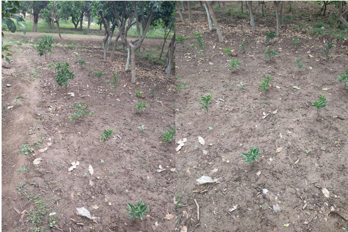
Fig. 4. Seedlings from under-developed seeds established in the field beds.