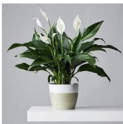
CN: Peace lily SN: Spathiphyllum spp. F: Araceae