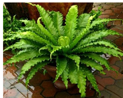
CN: Bird's nest ferns SN: Asplenium nidus F: Aspleniaceae