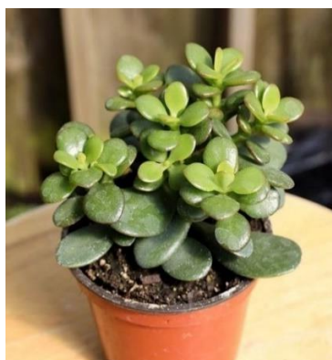
CN: Jade plant SN: Crassula ovata F: Crassulaceae