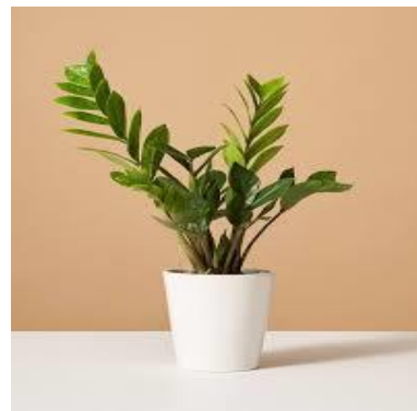
CN: ZZ plant SN: Zamioculcas zamiifolia F: Araceae