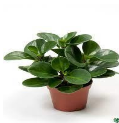
CN: Baby Rubber plant SN: Peperomia obtusifolia F: Piperaceae