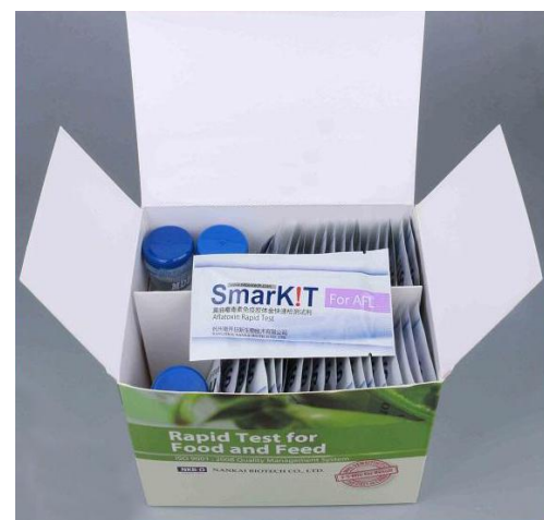
Figure4: Rapid aflatoxin detection kit

Awareness regarding aflatoxin contamination has been increased over time across the world. The awareness is mainly increased in Asian and African countries. However, as in Africa and Asia, the small farmers do most of the farming; proper monitoring and awareness regarding aflatoxin are complex. The upper limit of the aflatoxin is different in different countries; in the USA its 20 µg/kg, in the European union 0.10 µg/kg for AB 1 and 0.025 µg/kg for AM 1 for infant meals and India its 30 µg/kg for all foods.