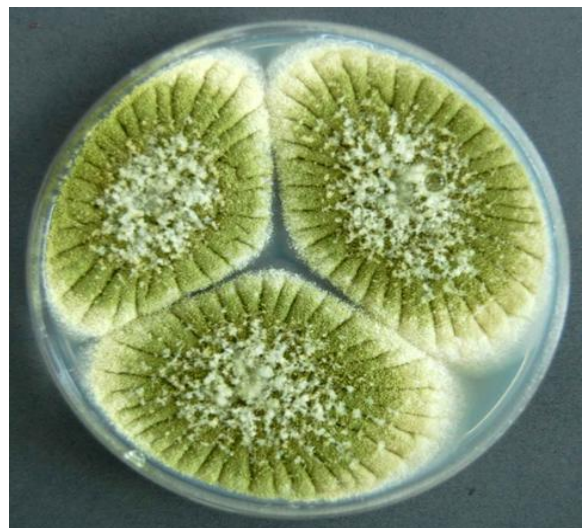
Fig1: Aspergillus flavus colony in agar medium

The word "Aflatoxin" itself is derived from the name of its causal organism, where "A" denotes Aspergillus , "fla" denotes flavus, followed by "toxin" or poison. The identification of aflatoxin as a potent mycotoxin goes back to the 1960s when more than a lakh of turkey birds died for no apparent reason, which the only shared connection was that all these birds