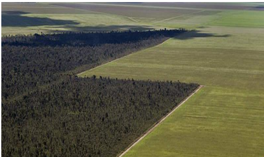
Figure 2: Conversion of Amazon rain forest to grazing land

In the initial days, the growth of the livestock sector was smooth as the land was not a limited resource. However, in recent times land as well as water has become a scarce resource. Apart from resource scarcity, livestock production is also putting substantial pressure on biodiversity conservation. The situation is worsened due to the formidable threat of climate change, especially in developing countries.