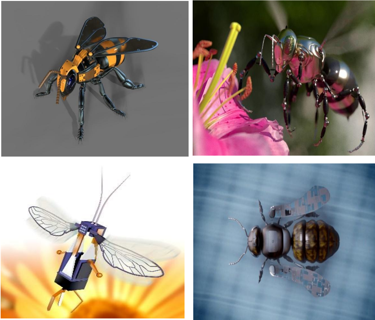
Fig 1: Different types and structure of Robobees

interacts with other members of its colony must all fit into that tiny container. These aims are becoming more attainable, thanks to recent advances in materials science, sensor technology, and computational architecture. Even if it doesn't have a complete image of the environment, a colony of thousands of Robobees will have to efficiently divide duties among people. The hive has been given the task of finding and pollinating flower fields. Individual Robobees begin by exploring various places. The new information changes where future workers will go as they return to the hive with information about where flowers are growing. More robots will be assigned to locations where there is more work to be done. Even though bee-to-bee communication is limited due to power limits, the hive-based technique allows bees to show collective intelligence.