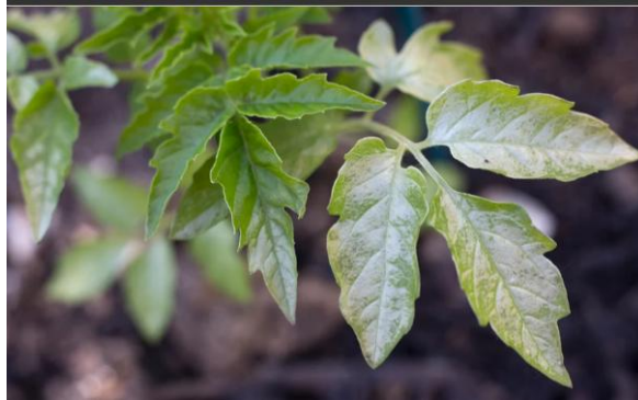
Fig. 10: low temperature injury in tomato