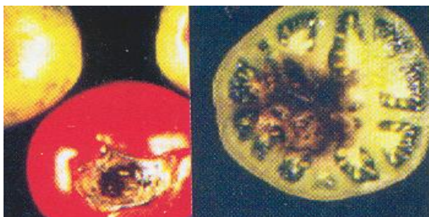
Fig. 8: Puffiness in tomato