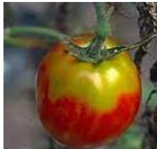
Fig. 6: Green shoulder on tomato