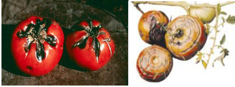
Fig. 2: Fruit cracking on tomato