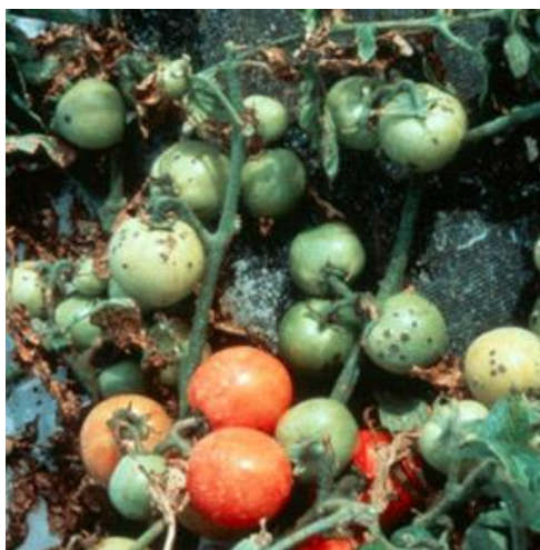
Fig. 9: Gold fleck and fruit pox on tomato