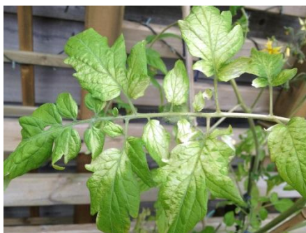
Fig. 7: Silvering on tomato