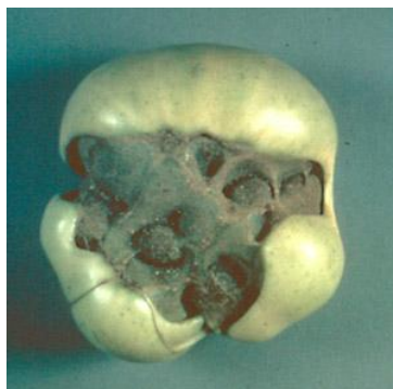
Fig. 3: Cat face on tomato