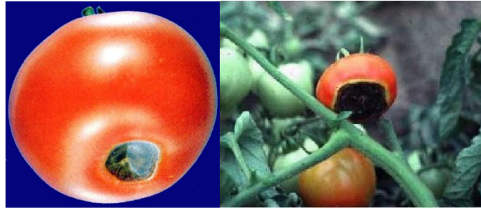
Fig. 1: Blossom End Rot (BER) on tomato