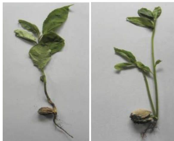
a. Normal seedling

The formation of embryo without sexual process is called apomixis and seed is called apomictic seed, the condition is called polyembryony. Polyembryony is the occurrence of more than one embryo in a seed which consequently results in the emergence of multiple seedlings. The additional embryos result from the differentiation and development of various maternal and zygotic tissues associated with the ovule of seed. Polyembryony usually associated with nucellar embryony because it frequently results in polyembryonic seeds from which multiple seedlings germinate. Based on genetic composition the polyembryony classified into I. Gametophytic: multiple embryos arises from the gametic cells of the embryo sac (synergid, antipodal) after or without fertilization. In this case haploid embryos are formed. The second one is Sporophytic where the multiple embryos arise either from zygote or from sporophytic cells of ovule (nucellus, integument) and the resulting embryo will be diploid.